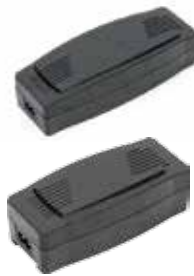
Transfo with or without battery backup facility