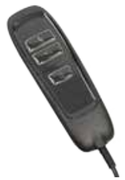
Handset Styline (1 motor lift)