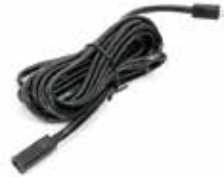
Extension cord 3,5m