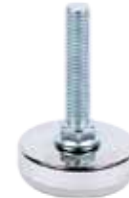
4 x adjustable glides (*)

(*) included in the standard configuration