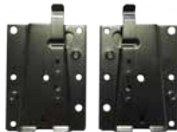
backrest bracket female LH / RH (*)